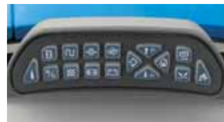
An enhanced performance monitor and radar are optional on all Plus and Elite models, allowing you to track and program a variety of functions including linkage height, PTO speed, hours, distance traveled and electronic remote valve status.