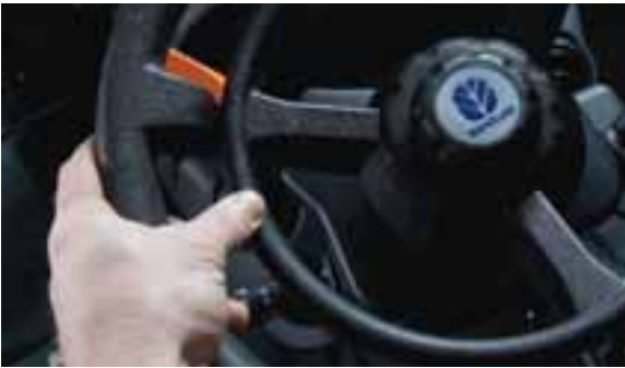
To engage FastSteer, simply press on the inner ring of the steering wheel. The FastSteer system automatically disengages when travel speed exceeds 10 km/h.