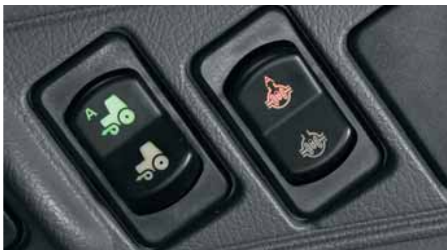
The TerraLock™ system automatically controls FWD and differential lock engagement to give you maximum traction and control.

Self-adjusting, self-equalizing hydraulic wet disc brakes deliver the stopping power you need. When both brake pedals are applied simultaneously, FWD engages automatically to aid in braking action for added control.