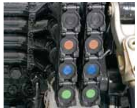
Hydraulic control levers and remote coupler dust covers are color-coded to assist with easy implement hook up and control.