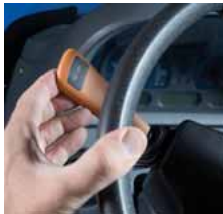
The clutch-free power shuttle is electro-hydraulically engaged and located to the left of the steering column for easy fingertip control.