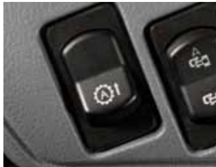
Just press the "Auto" button, and the Power Command™ transmission automatically shifts up or down within a span of gears based on engine RPM and applied flywheel torque.