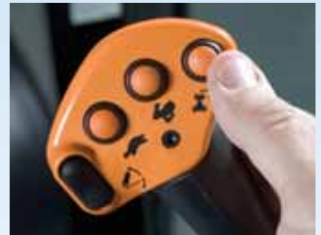
Switches on the right-hand console are used to alert the system that you are ready to record (A) or play back (B) a sequence of actions. Then, press the “step” button to actually activate the recording or play-back. The step button is located on the multi-controller (C) on Elite six-cylinder models, and on the seat-mounted electronic draft control mouse on Elite four-cylinder models.