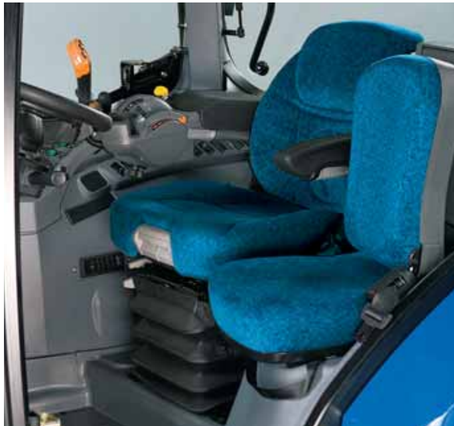
A comfortable, supportive, full-size instructor seat is a Horizon cab option.

For the absolute smoothest ride over bumpy ground, choose the Comfort Ride™ Cab Suspension option available on Plus and Elite models. This simple mechanical system is always on. Two isolation "donuts" at the front corners of the cab and a swaybar and two shock absorbers at the rear isolate you from up-down motions and side-to-side swaying.