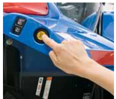
Quick-raise hitch switches are provided on both rear fenders on tractors equipped with electronic draft control. An exterior PTO switch is also optional on the rear fender of all cab models (except 12x12 transmission). Press the button for less than five second for a pulsing action that makes it easier to hook up the PTO shaft. Hold the button for longer than five seconds to fully engage the PTO.