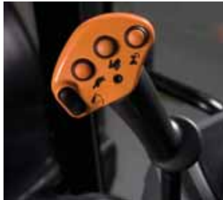
The convenient seat-mounted multi function controller gives you complete transmission control on Power Command equipped models.